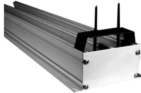
D. END CAP