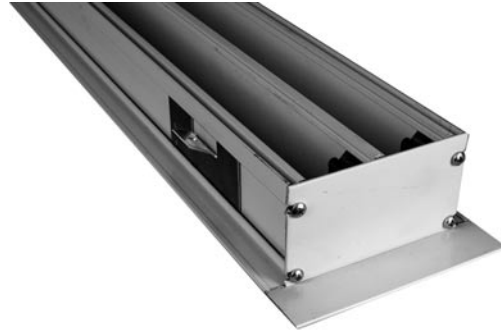
B. WIRE HANGER BRACKET