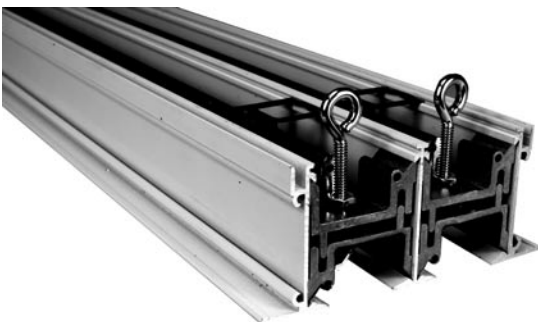
G. EYE BOLTS