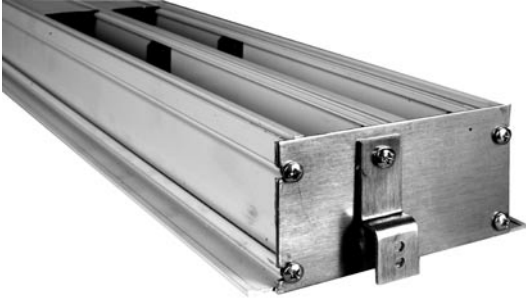
A. T-BAR CLIP