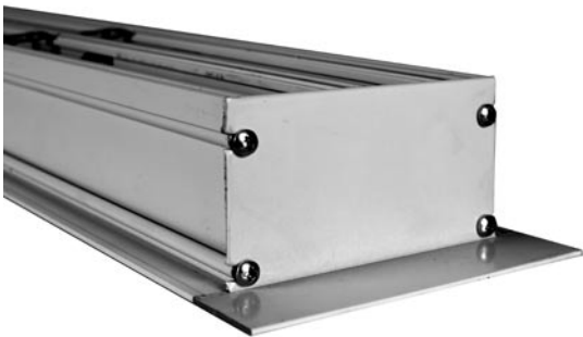
E. END FLANGE